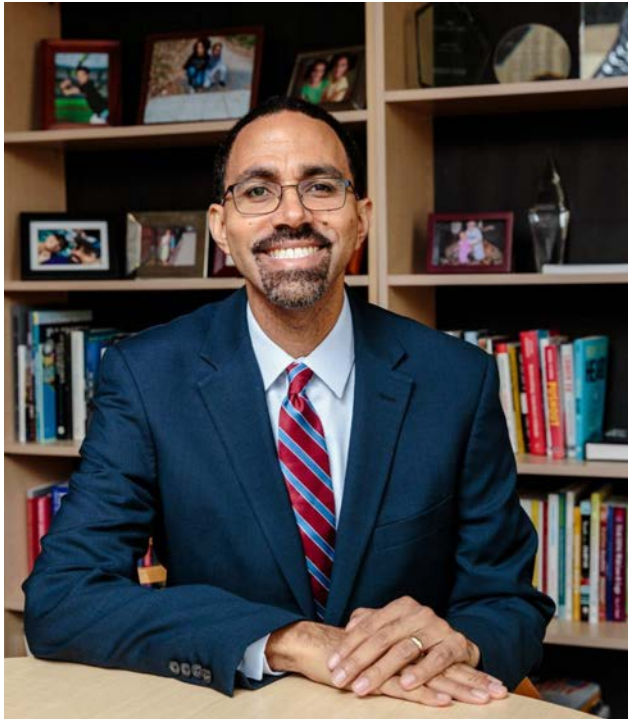
John B. King, Jr. The Education Trust